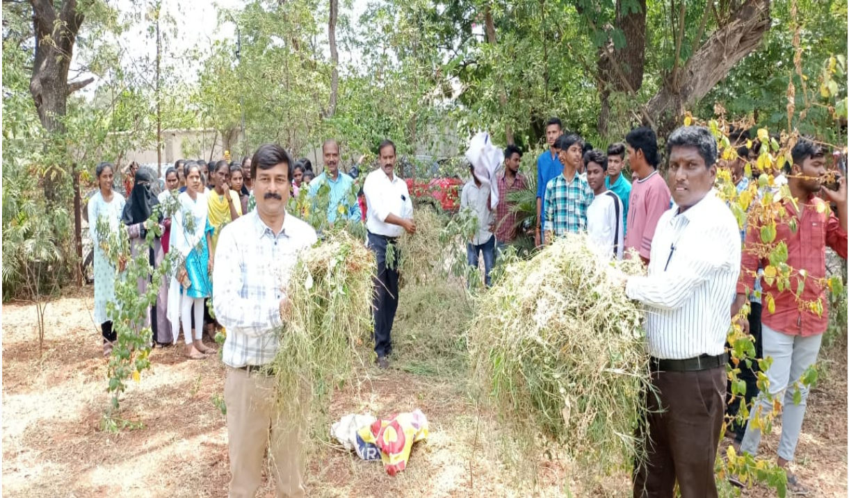
on the occasion of world environment day eco club conducted clean and green, weedicide removal programme in college botanical garden on 04/06/2022.