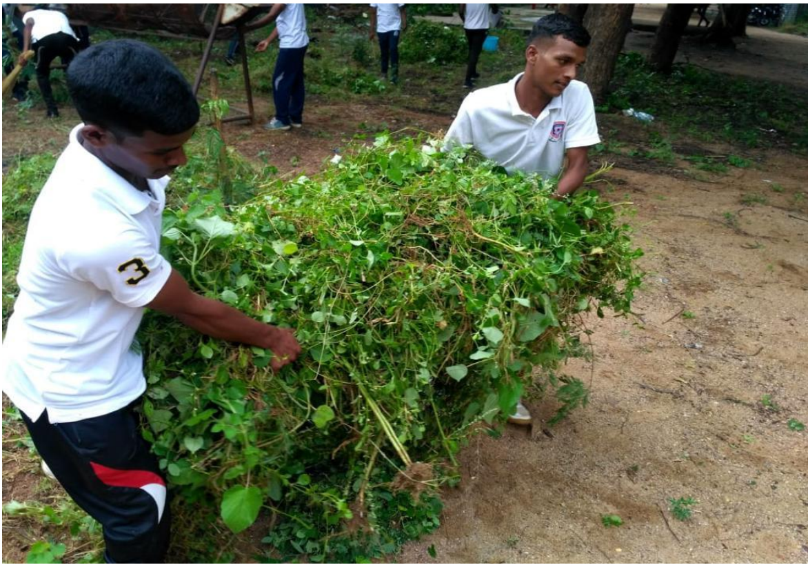
Cleaning and removal of weeds in college campus 07.08.19.