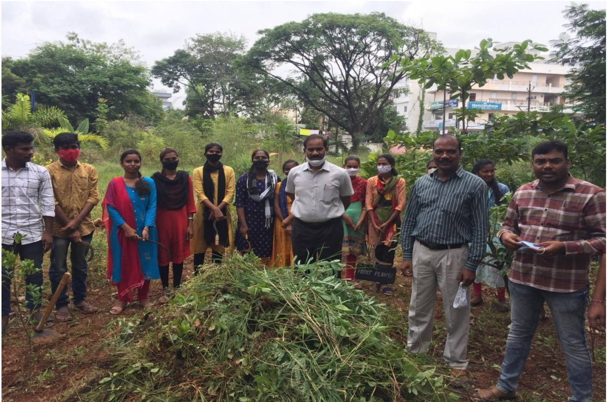
Clean and Green programme in the college Botanical Garden on 18/11/2021