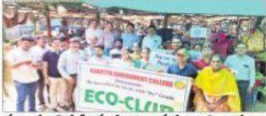
ప్రచారం నిర్వహిస్తున్న అధ్యాపకులు, విద్యార్థులు

విద్యారణ్యపురి: ప్లాస్టిక్ బ్యాగులు వాడొద్దంటూ హనుమకొండలోని కాకతీయ ప్రభుత్వ డిగ్రీ కళాశాల ఎకో క్లబ్ ఆధ్వర్యంలో అధ్యాపకులు, విద్యార్థులు ప్రచారం నిర్వహించారు. ఈమేరకు హనుమకొండలోని కూరగాయల మార్కెట్లో