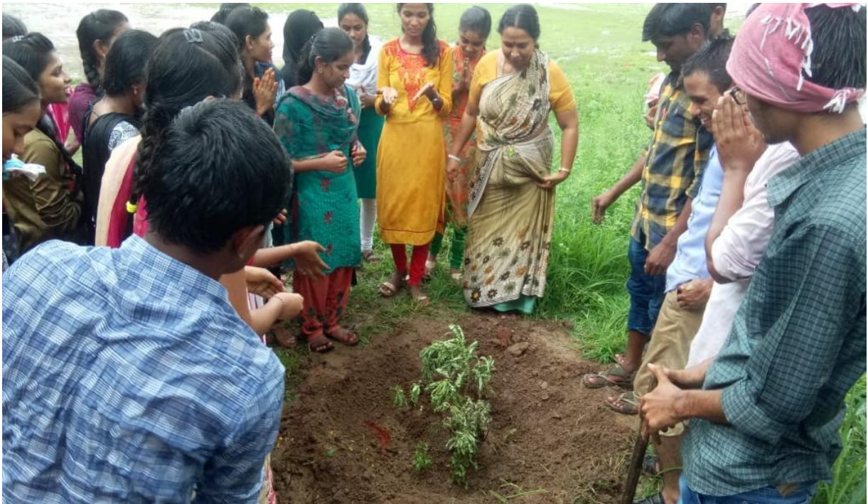
Cleaning of weeds and Plantation in college campus 31-08-18