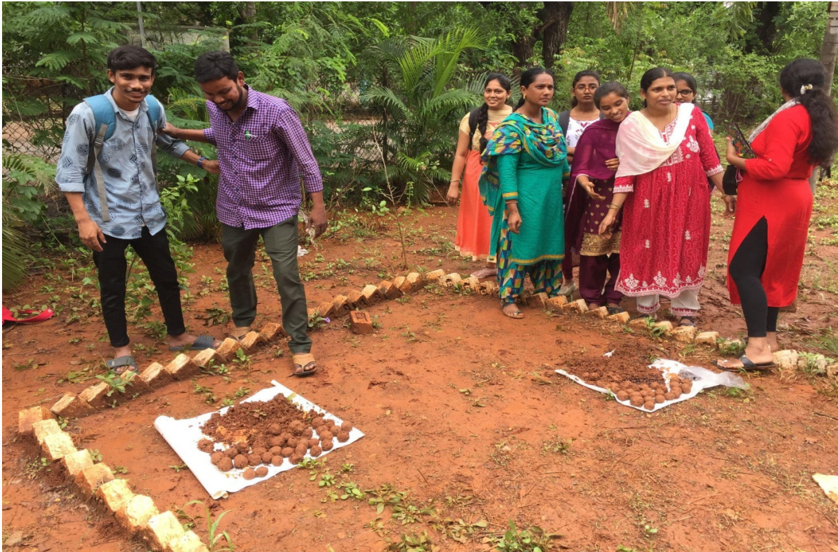
Preparation of seed balls in the college botanical garden on 23/06/2021