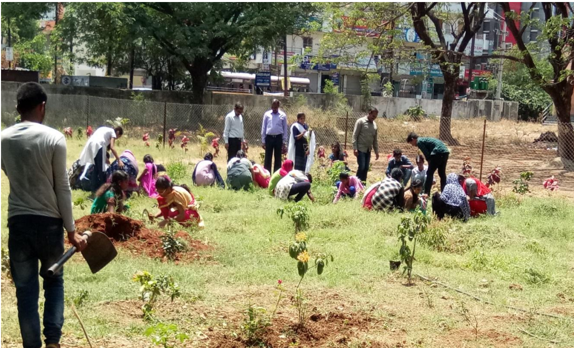
Plantation programme in college campus on 10-08-2018