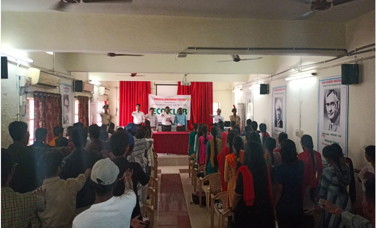
on the occasion of world environment day eco club conducted awareness programme on no plastic use and global warming, student taken swachhta pledge on 04/06/2022.