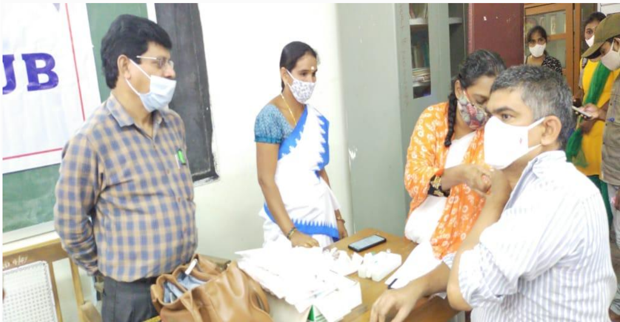
COVID vaccination camp organized in the college, in association with health club on 15/11/2021 for the benefit of students and staff.