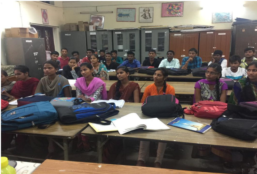
World Earth day – Talk on Global Warming on 22-04-2019