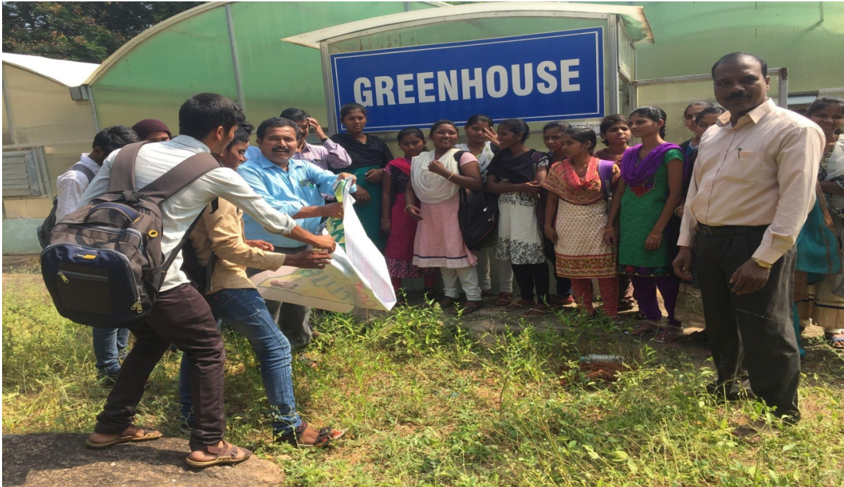
Field trip conducted to Biotechnology Dept.Kakatiya University, by Ecoclub on 3rd Nov 2017