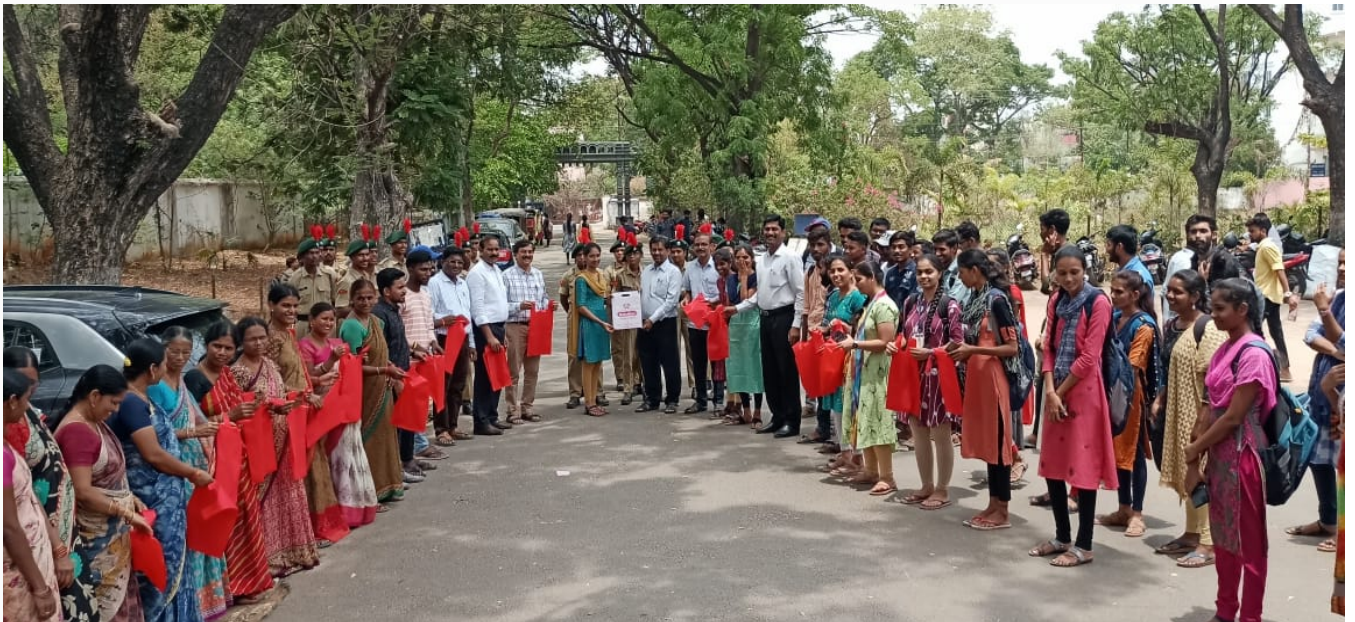
on the occasion of world environment day eco club distributed cloth bags to non teaching staff and students 04/06/2022.