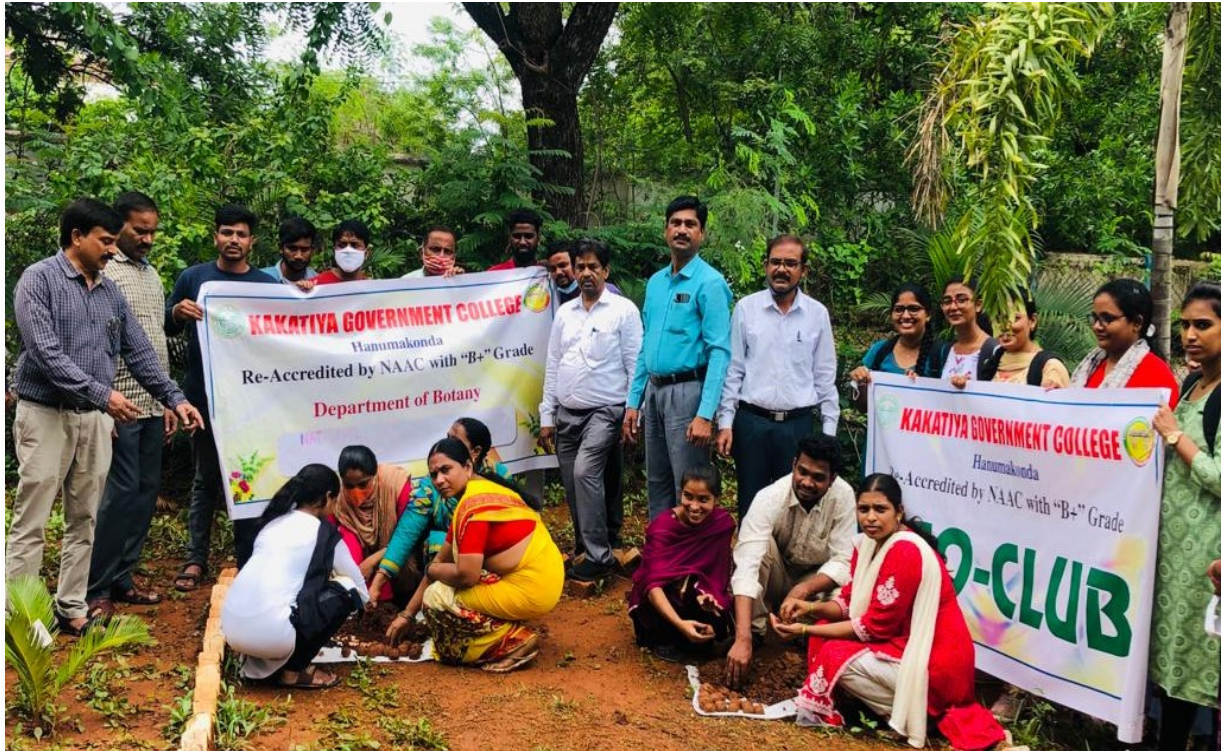
Preparation of seed balls in the college botanical garden in association with Botany Dept. on 22/06/2022