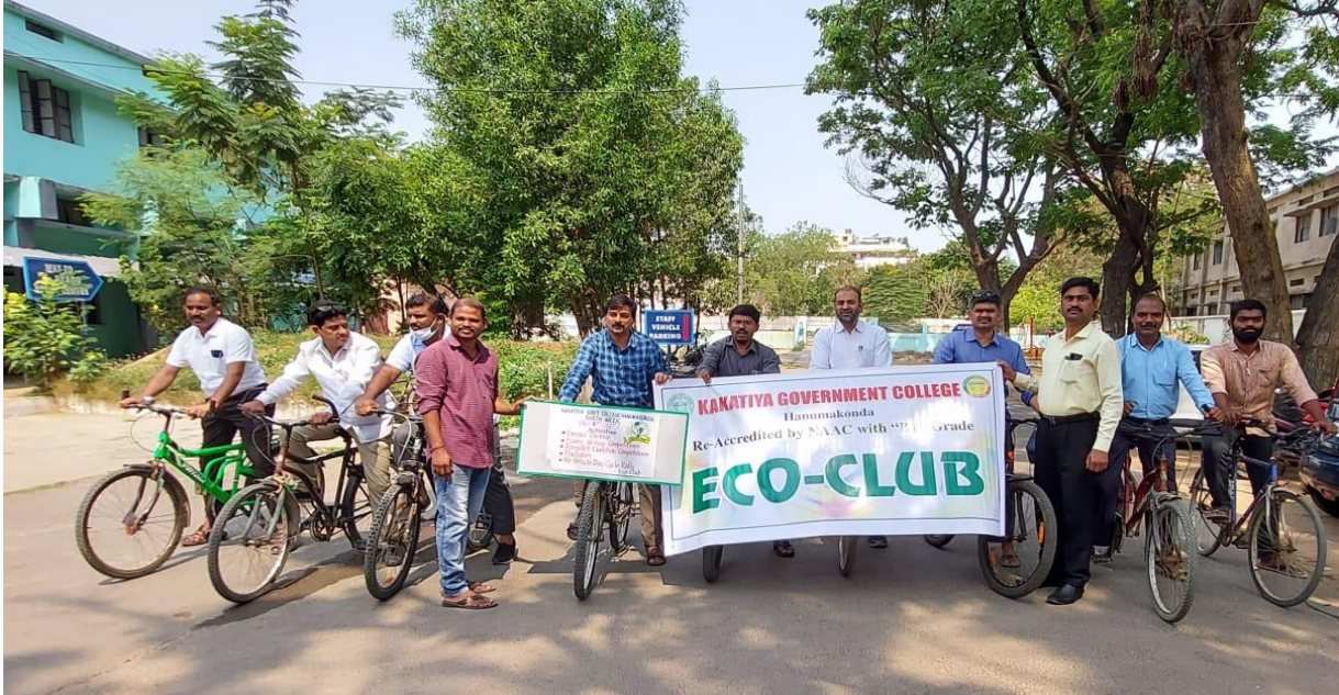
Cycle rally conducted from KGC to Public Garden on the occasion of world earth day on 22 nd April 2022 by ECOCLUB to create awareness on vehicle pollution to the students.