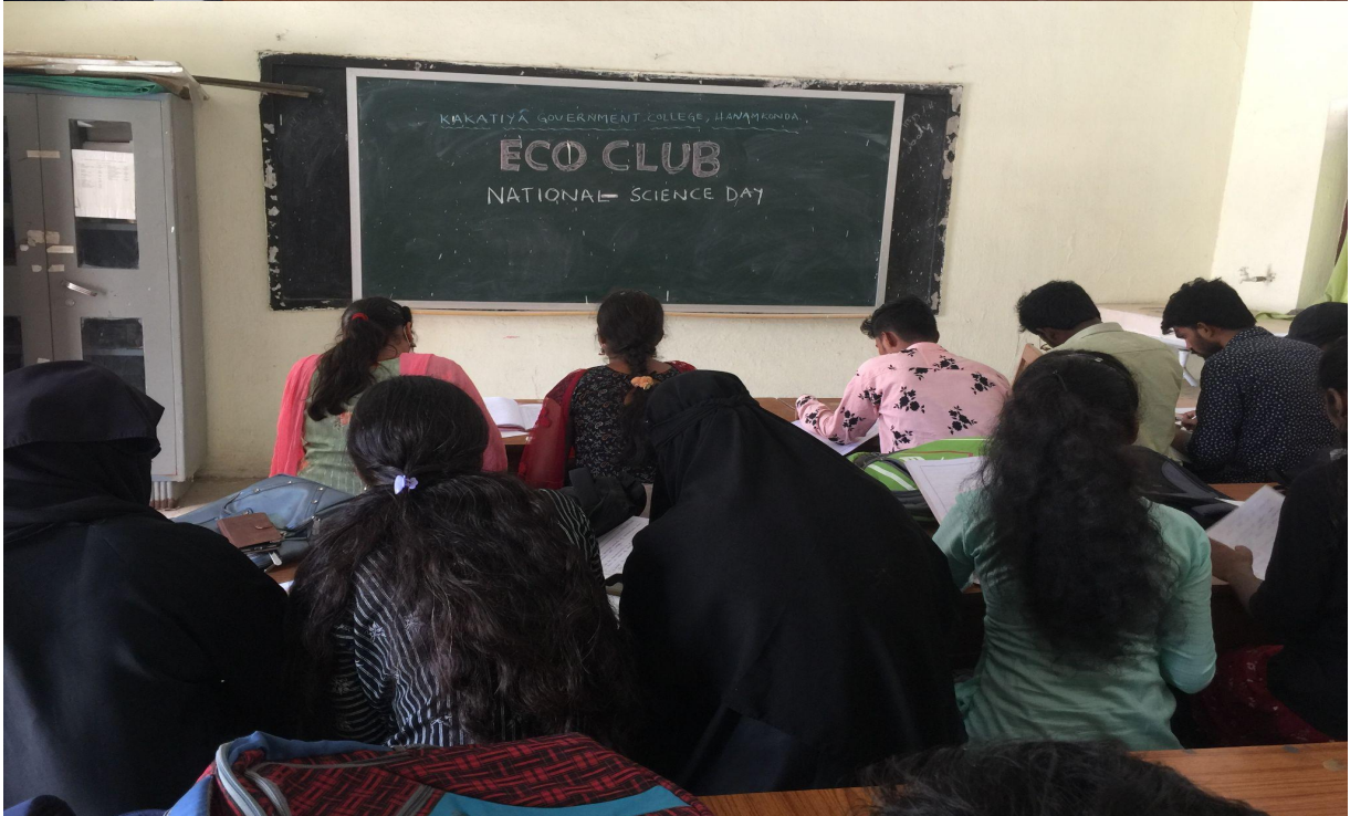
Essay writing competition conducted to B.Sc III Year students on the occasion of national science day on 28-02-2017.