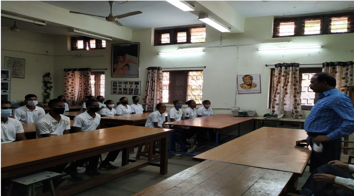
COVID awareness programme conducted to NCC cadets on 18/12/2021 in association with Health club.